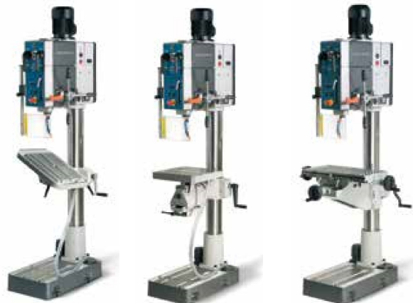
With rotating table plate and tilting support (MGI).